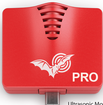
Ultrasonic Module for Android