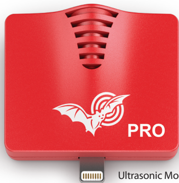
Ultrasonic Module for iOS

The Echo Meter Touch 2 PRO Ultrasonic Module features a rugged ABS/polycarbonate housing with an integrated acoustical horn, designed to reduce reflections from surrounding objects.